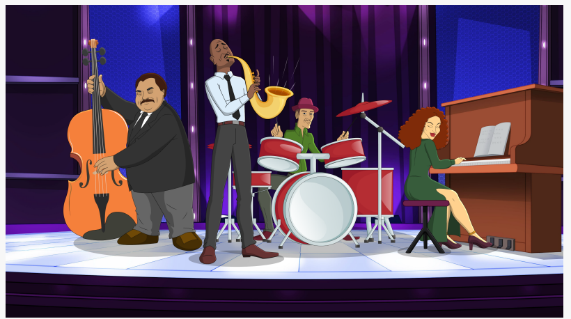
A musical scene featuring Otis Walker from Jazzy Bells, an animated short written and directed by Dara Frazier.

This press release can be viewed online at: https://www.einpresswire.com/article/783873956