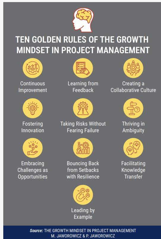
Golden Rules of Growth Mindset in Project Management