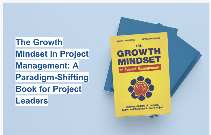
Paradigm Shifting Book for Project Leaders