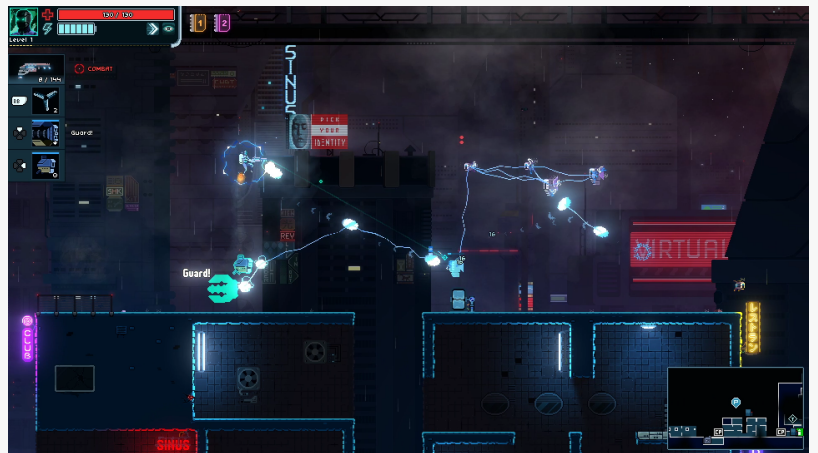
Overpowered build with electricity synergies