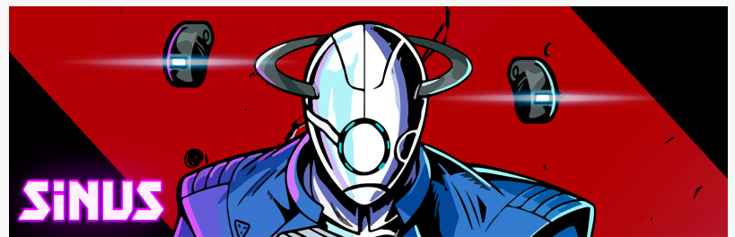
Sinus Demo Now Available

Permanent progression through ship console upgrades