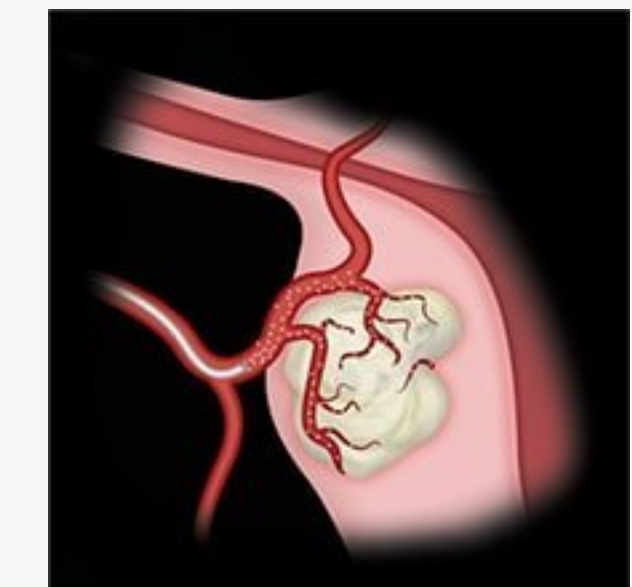
Tiny particles are injected into vessel to block blood supply to fibroids making them shrink

centered care, and advanced technology, the clinic provides personalized treatment plans in a compassionate, supportive environment.