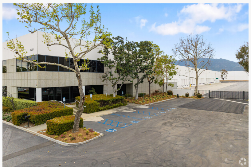
Premier Packaging Opens CA Facility