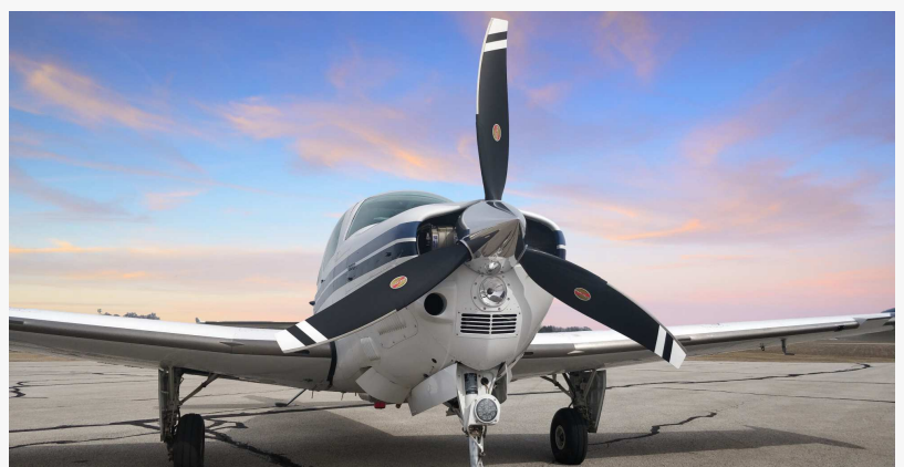
Beechcraft Bonanza with Hartzell Navigator Composite Propeller

5-blade turboprop applications for Kodiak, Pilatus and TBM