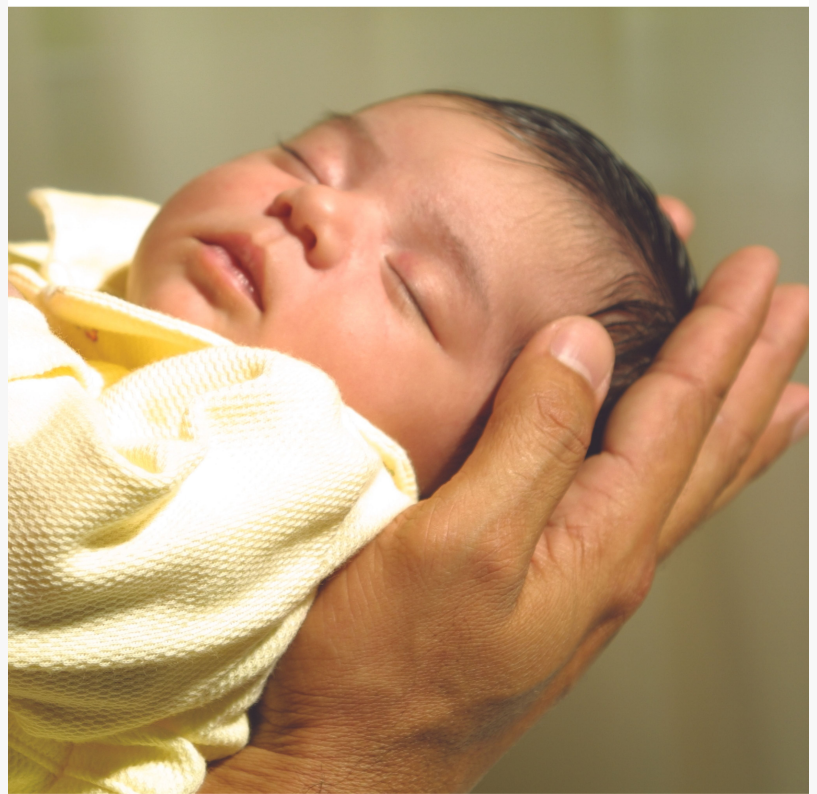
Newborn sleeping peacefully in caring arms.