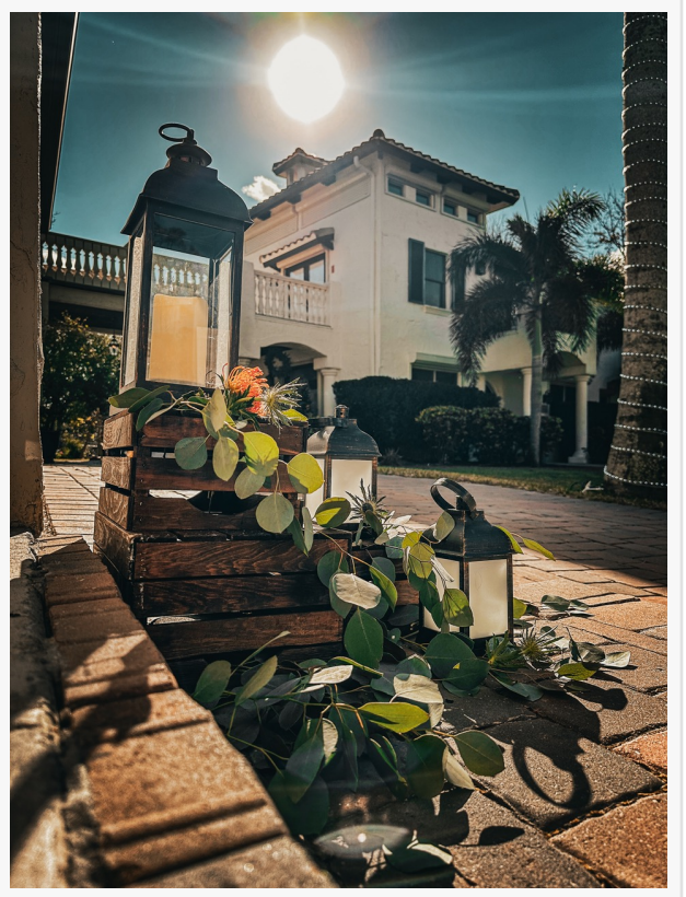
Bonita Ranch Mediterranean Plant Nursery and Wedding Venue

Unlike traditional wedding expos, this event will bring wedding trends to life by recreating the elegance of a real European wedding experience—with luxurious ceremony sites and lounge areas designed by Absolutely Fabulous and