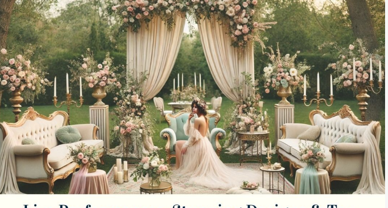
Live Performances, Stunning Designs & Top Vendors in Action!

Support Local Businesses & Plan Your Dream Wedding