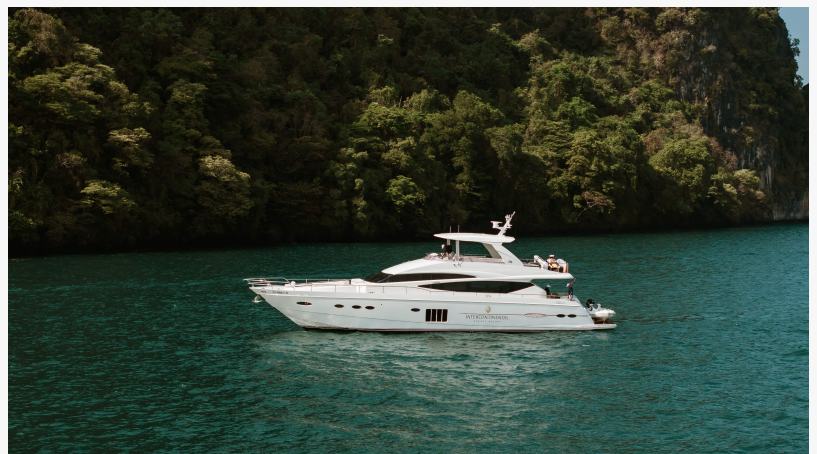
W.J. Lip Luxury Yacht

Secluded white-sand beaches, majestic limestone cliffs, and turquoise waters set the scene for an unforgettable adventure in the Andaman Sea, with personalized service adding a special sparkle to every moment. The highly trained InterContinental crew members, brings the same impeccable service on board that has earned the resort global acclaim.