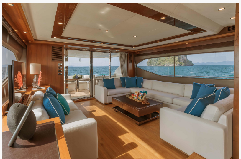
W.J. Lip Living Room

https://phuket.intercontinental.com/princess-78-Yacht