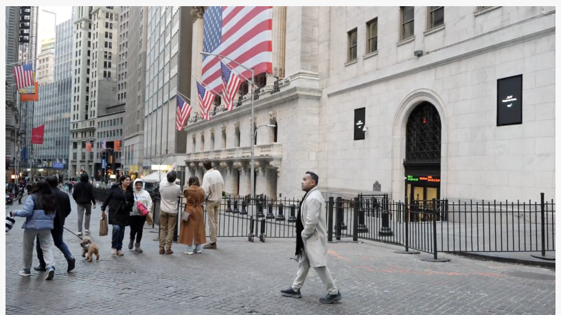
Wall Street, Manhattan. Once the financial centre of the world, is now more of a tourist attraction

CYBERJAYA, SELANGOR, MALAYSIA, February 10, 2025 /EINPresswire.com/ -- Crewstone International Private Equity & Investments, a leading private equity firm headquartered in Kuala Lumpur, is pleased to announce its strategic expansion into New York City. This move underscores the firm's commitment to leveraging its Southeast Asian expertise to invigorate and support the evolving landscape of New York's capital markets.