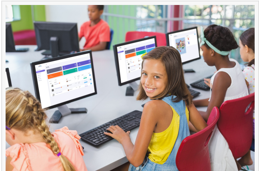
Life Hub Learners in School

TAMPA, FL, UNITED STATES, February 10, 2025 /EINPresswire.com/ -- High-impact edtech and fintech startup Electus - based in Tampa and backed by Google for Startups and The American Heart Association Social Impact Fund - is one of only 13 companies to secure a place in the prestigious Plug and Play Visa Inclusive Fintech Accelerator Program 2025.