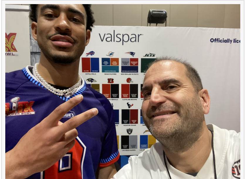
TravelingWiki Appears On the Day Before Super Bowl LIX with Carolina Panthers Quarterback Bryce Young

NEW ORLEANS, LA, UNITED STATES, February 8, 2025 /EINPresswire.com/ -- Leading up to Super Bowl LIX, following rapid growth across 50 US states and across the world, and engagement at Super Bowl LIX festivities with 10 network affiliates and 20+ professional athletes over recent days and an extensive investment into resources in twelve languages, TravelingWiki for the first time in its existence appeared in the Top 6 Global Stories on Google & Beyond as to Super Bowl LIX. As part of this work, TravelingWiki completed the following on February 7, 2025: