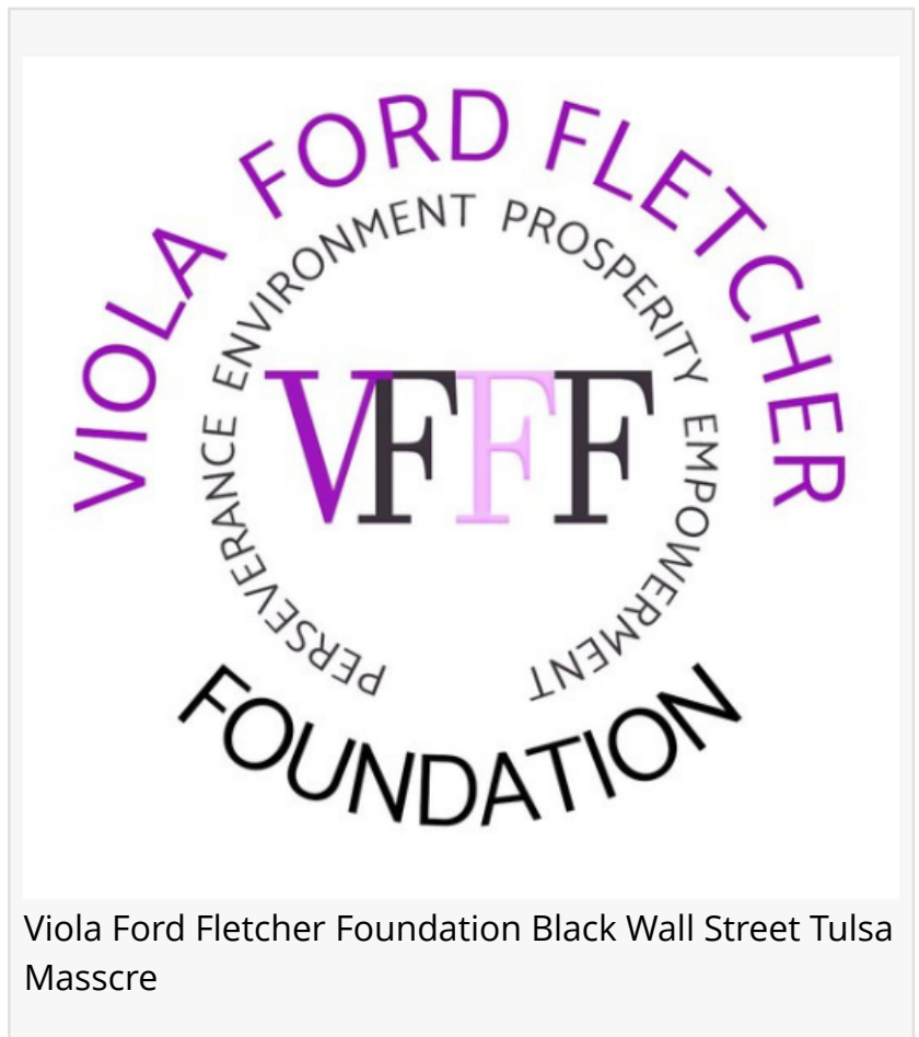
Viola Ford Fletcher Foundation Black Wall Street Tulsa Masscre

Facebook X Instagram YouTube TikTok Other