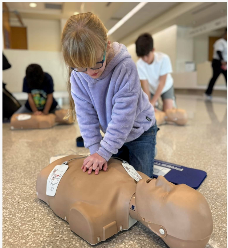
Youth receive hands-on, life-saving training during National Youth Heart Screening Day, equipping the next generation of lifesavers with the skills to respond effectively to sudden cardiac arrest.