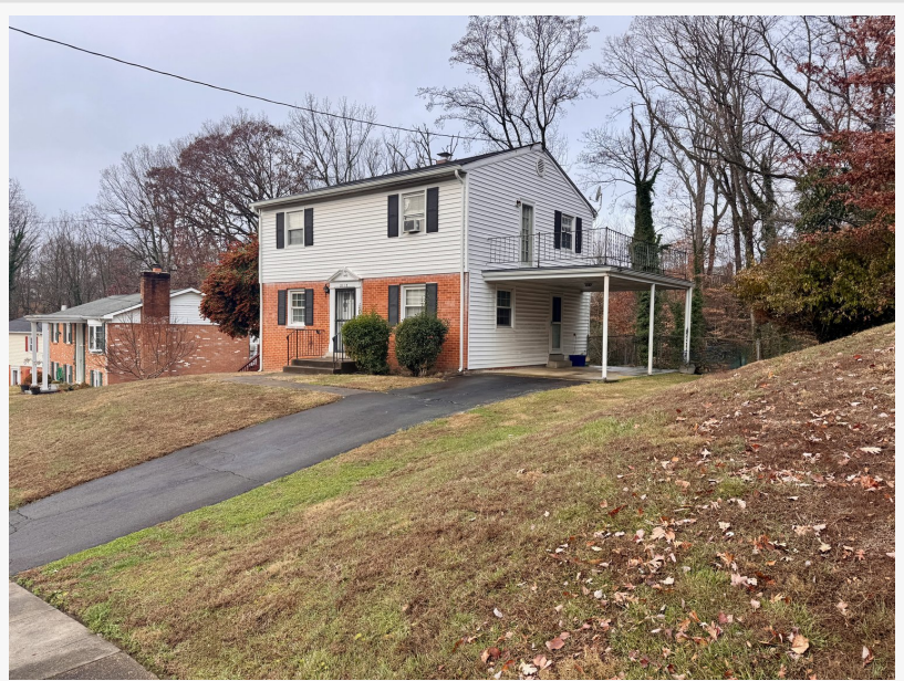
2112 Patrick St., Woodbridge, VA 22191 (Prince William County)