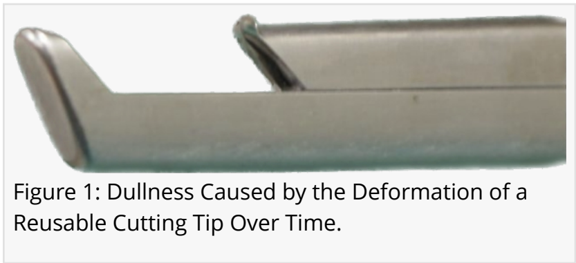
Figure 1: Dullness Caused by the Deformation of a Reusable Cutting Tip Over Time.

Spartan's single-use Sterile Always Sharp (SAS) Kerrison is a high-quality metal instrument with the traditional look and feel of reusable Kerrisons; but, without the issue of a dull or deformed cutting surface from continued use and reprocessing. Surgeons can have confidence that the SAS Kerrison's cutting surface will always be sharp straight out of the package.