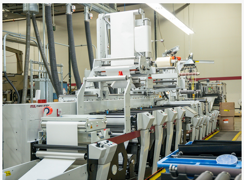
New Mark Andy DLI Die Cutter