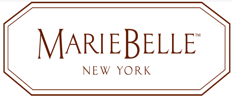
Mariebelle Chocolate Logo