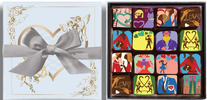
Mariebelle New York Valentine’s Day Collection