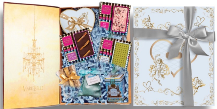
Mariebelle New York Valentine’s Day Collection