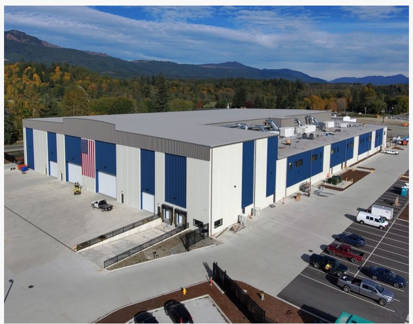
Exterior of Janicki Industries Building 10 by Chad Fisher Construction

- Safety Commitment: Chad Fisher Construction has been a Safety Team member since 2015.