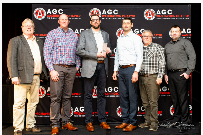
Chad Fisher Construction receives AGC of Washington's Construction Excellence Award

MOUNT VERNON, WA, UNITED STATES, February 11, 2025 /EINPresswire.com/ -- Chad Fisher Construction , a leader in innovative and sustainable construction solutions, is proud to announce that the company has been awarded the prestigious Construction Excellence Award by the Association of General Contractors (AGC) of Washington. This recognition celebrates the company's groundbreaking work on the Janicki Industries Building 10 project , a state-of-the-art facility designed to support advanced aerospace manufacturing.