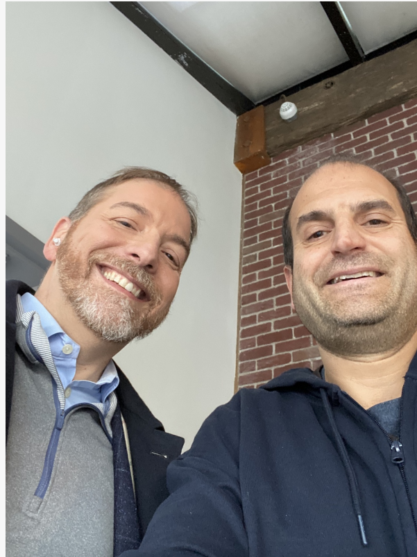
TravelingWiki Foundation with NBC News' and Prior Meet the Press Host Chuck Todd in Manchester, NH During Early 2024

The rapid growth surrounded engagement at Super Bowl LIX festivities on February 5, 2025 with