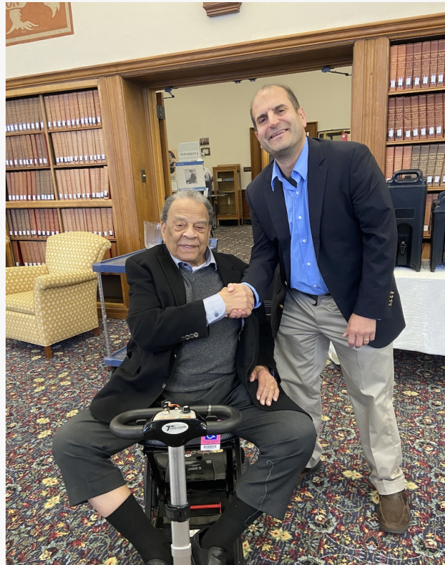
TravelingWiki Brought to Drake University to Engage with Former UN Ambassador Andrew Young