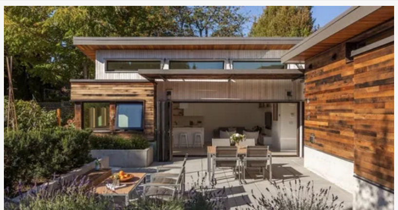
ADU Design and build services Los ... es

ADUs are becoming increasingly popular in urban areas like Los Angeles, where limited land and high property costs have led to a demand for efficient space utilization. 121 Design Build Inc. has responded to this need by offering comprehensive design and build services aimed at helping homeowners create customized and functional ADUs. From initial consultations to project completion, 121 Design Build Inc. works closely with homeowners to bring their vision to life.