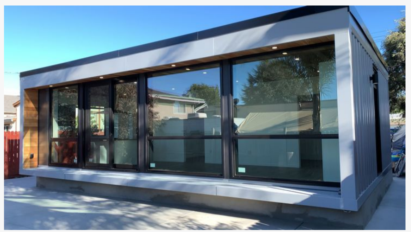
ADU Architects in Los Angeles

The ADU designs offered by 121 Design Build Inc. are crafted with an emphasis on modern design principles that blend aesthetic appeal with practical use. Homeowners are encouraged to discuss their preferences, and the firm's architects ensure the designs reflect a contemporary yet functional style. Whether the goal is to create a sleek studio apartment or a more expansive multi-room unit, the firm has the capability to deliver a solution that fits.