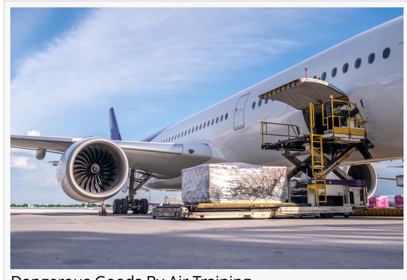
Dangerous Goods By Air Training

Risk Identification and Management – Recognizing hazardous materials and understanding their potential risks.