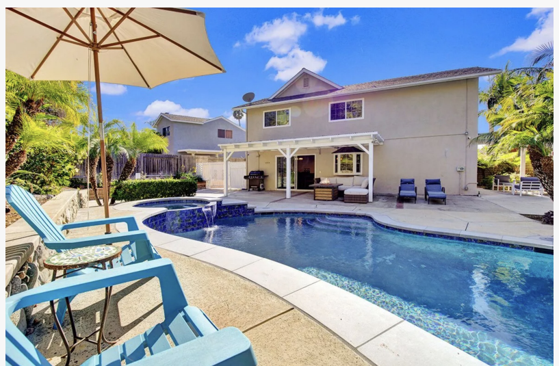
Still Water Wellness Has Unique Amenities for its Patients

LAKE FOREST, CA, UNITED STATES, February 11, 2025 /EINPresswire.com/ -- Still Water Wellness Group, a leader in integrated behavioral health treatment, is proud to announce its specialized Couples Alcohol Rehab in Orange County . This innovative program is designed to support couples on their journey to recovery from alcohol addiction, emphasizing healing, reconnection, and the building of a stronger, healthier relationship.