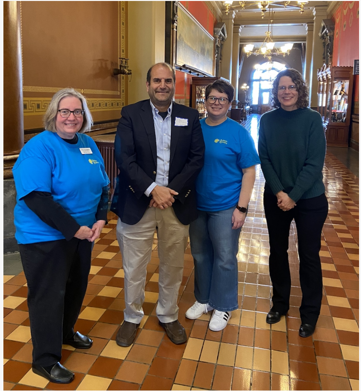
TravelingWiki Joins Autism Society of Iowa Leadership Following My Remarks to Attendees at Iowa State Capitol During 2025 Autism Advocacy and Acceptance Day on the Hill