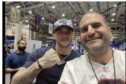
TravelingWiki with World Renowned MMA Athlete Dustin Poirier