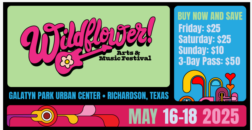
Wildflower! Arts & Music Festival Tickets