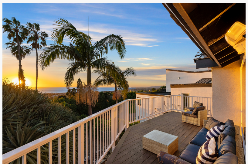
Oceans Luxury Rehab just steps away from the beach in Southern California