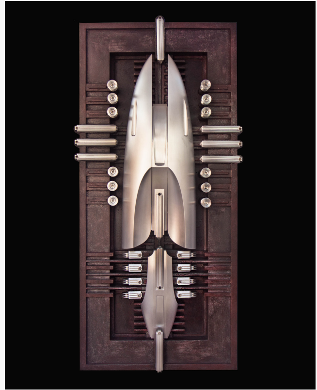
Artist Proof #4 Sylvia P