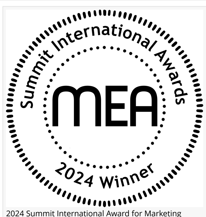
2024 Summit International Award for Marketing Effectiveness

Maven's award-winning overhaul significantly enhanced user engagement for Klarinet Solutions, bringing their tagline, "Elevate Your Workplace," to life. This optimization of the digital experience also highlighted Klarinet's proprietary Elevated Success Framework, a key differentiator in their role as a Microsoft Partner.