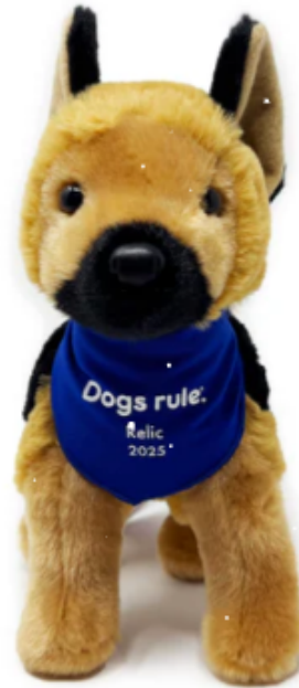
The commemorative Relic plush dog is for sale at DogsRuleStore.com