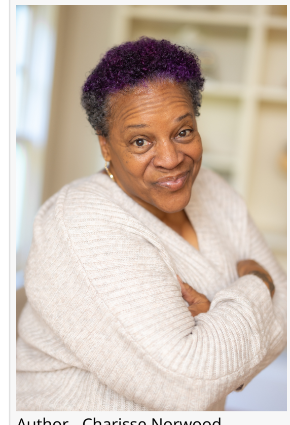
Author - Charisse Norwood

The memoir details her emotional journey from trauma to healing, revealing how she confronted her past, embraced change, and ultimately discovered inner peace