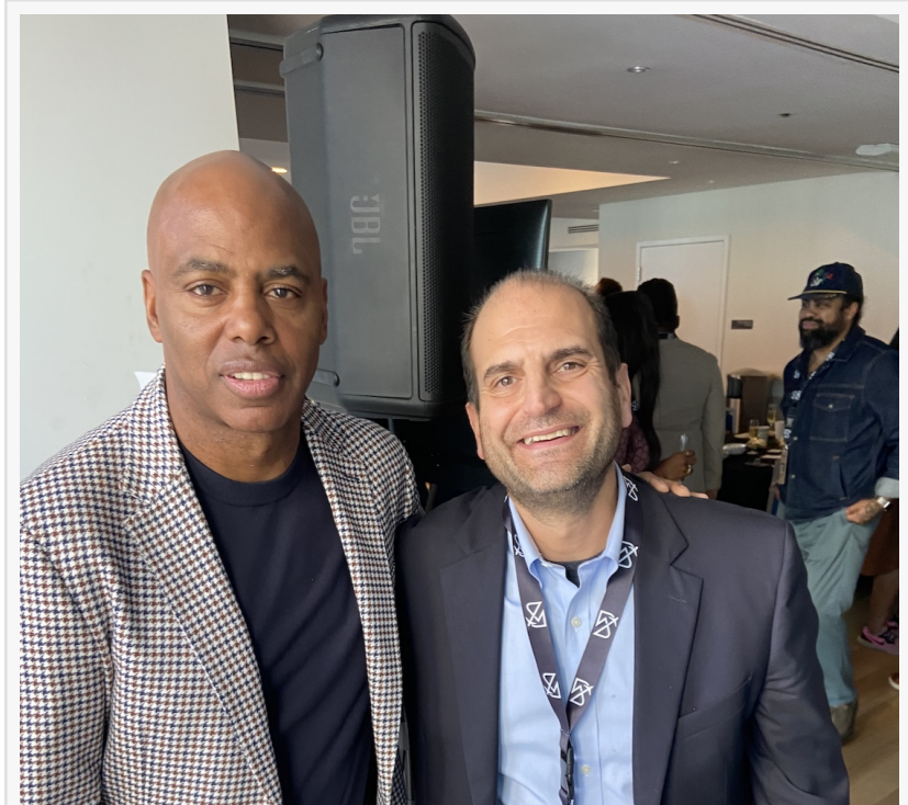
TravelingWiki Foundation Discussing its Non Profit Work with the Co-Host of Entertainment Tonight, Kevin Frazier

The work this week arises after both Crunchbase and ZoomInfo have leveraged TravelingWiki's resources for profiles of organizations. Microsoft Bing highlighted TravelingWiki as one of the most "Recognized Brands and Resources" in its space as to Autism Travel & beyond, specifically also referencing "Fights for Children With Autism." This also occurs as TravelingWiki launched its Experiential Learning Program the past few weeks in partnership with The Drake University College of Pharmacy & Health Sciences, including a presentation at Iowa State University. The past few weeks also included interviewing for the 2026 Experiential Learning Program at Drake University. This is the second time in a matter of months that TravelingWiki Foundation has traveled to Ames, Iowa to present to Generation Z on these resources.