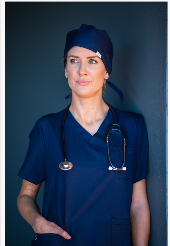
Softies Scrub Top