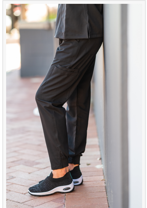
Softies Eton Scrub Pants

Designed for Today's Healthcare Professionals