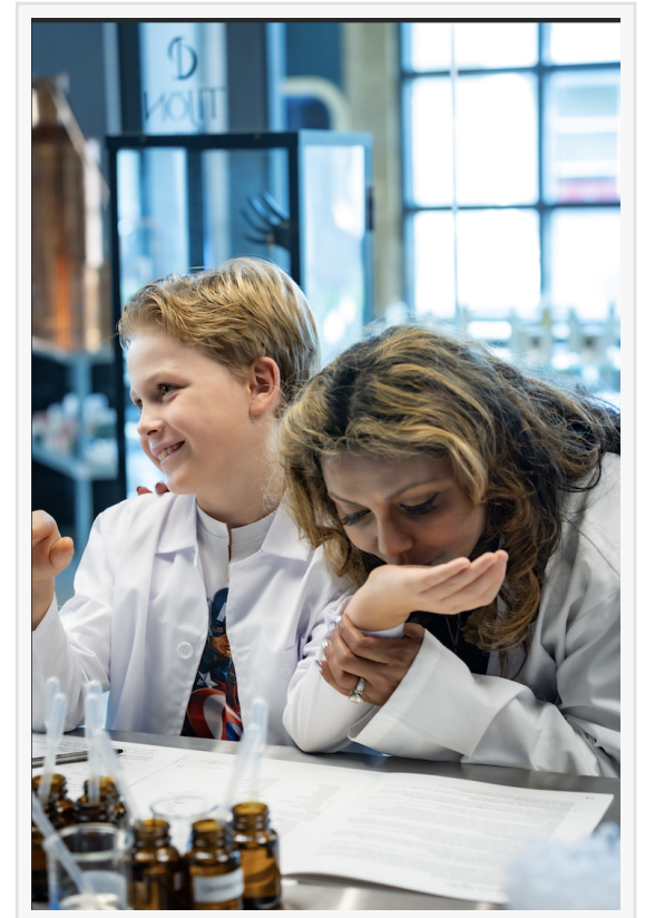
Experience custom fragrances at Tijon Miami