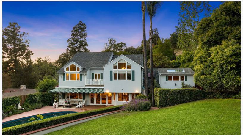
11818 Laurel Hills