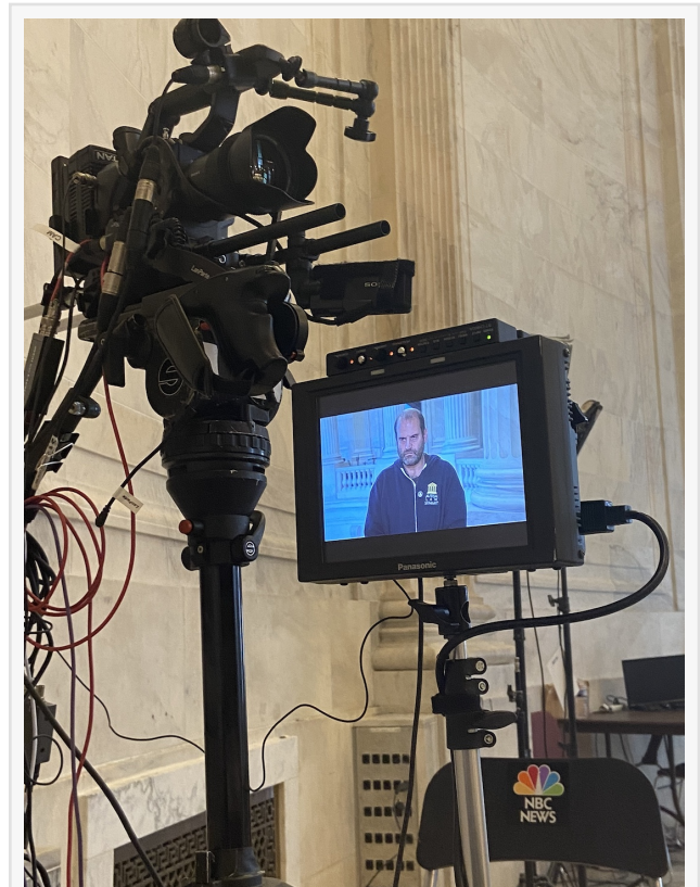
TravelingWiki with NBC News on Capitol Hill to Promote Autism Awareness