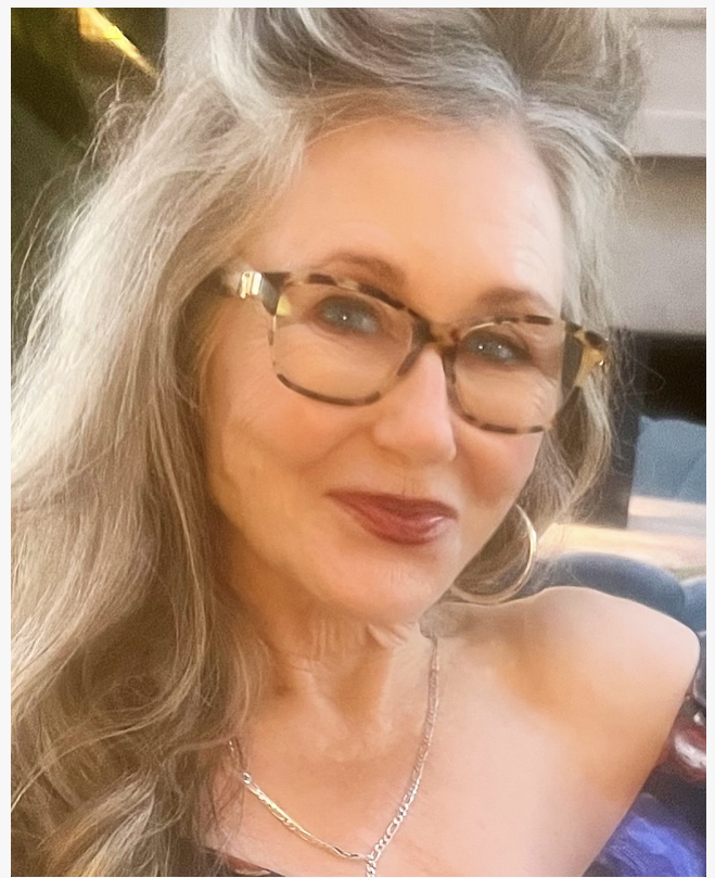
Mary McDonnell, Two-time Academy Award Nominee (Dances with Wolves)

This press release can be viewed online at: https://www.einpresswire.com/article/785505725