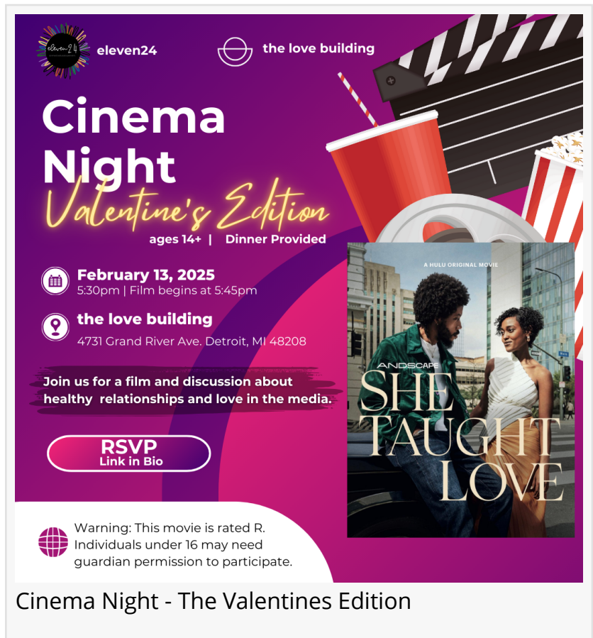
Cinema Night - The Valentines Edition