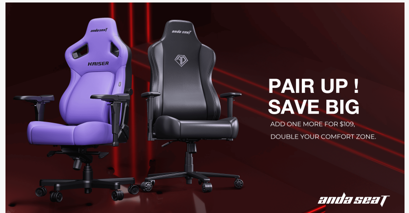
SPRINGDEAL new 2025