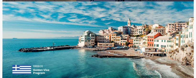
Investment led routes to Golden Visa and Schengen Residency in Greece, Portugal and Latvia