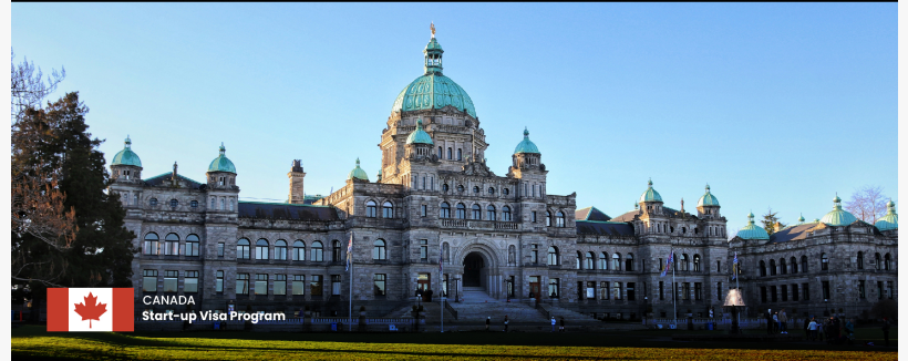
Golden Visa and Permanent Residency Programs in the US, UK and Canada