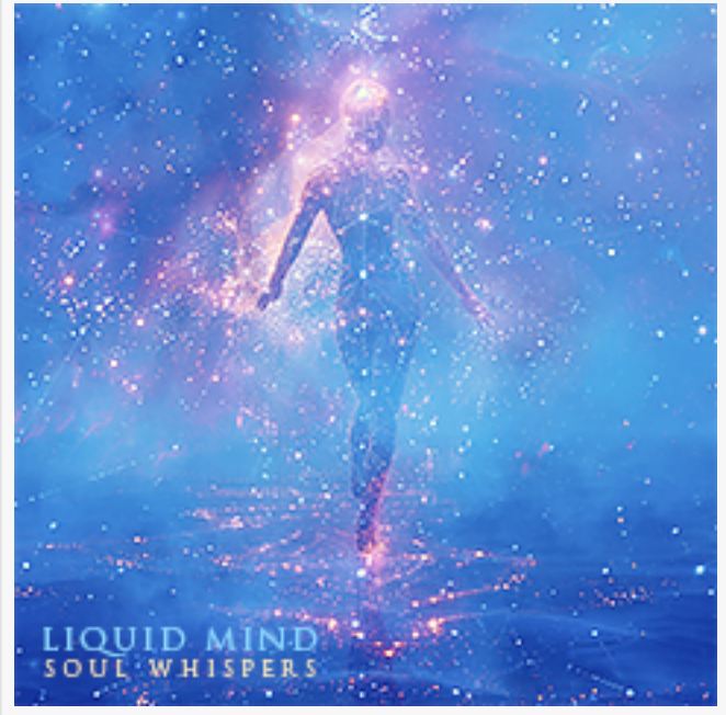
The album's second single is the gentle "Soul Whispers."

"Gratitude" is the first single on the album, with accompanying video.