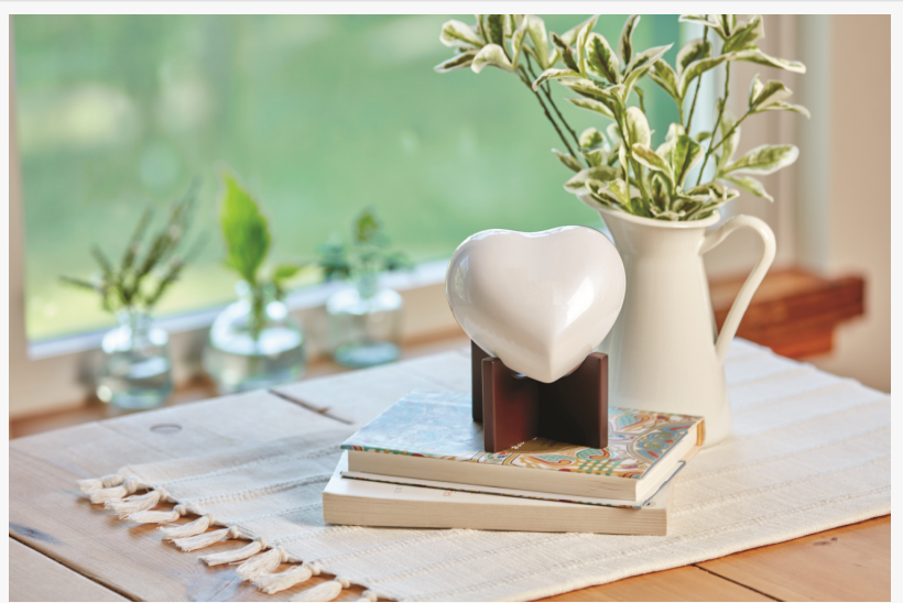
Forever Loved Heart Keepsakes

Cuddle Stones by The Living Urn and Forever Loved Heart Keepsakes are available now online and at a funeral home near you.