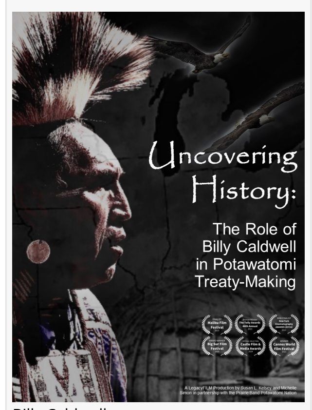
Billy Caldwell poster