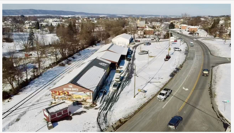
522A S. Main St., Broadway, VA 22815 (Rockingham County)