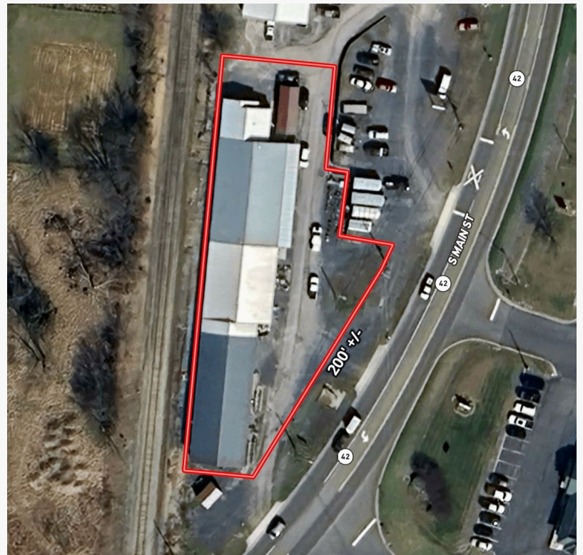
522A S. Main St., Broadway, VA 22815 (Rockingham County)