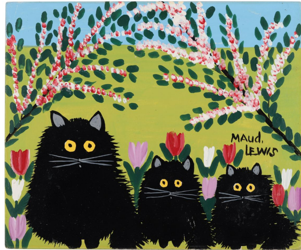
Oil on beaverboard painting by Maud Lewis (Nova Scotia, 1901-1970), titled Three Black Cats , rendered in the second half of 1965, the artist's most iconic image (CAS$44,840).