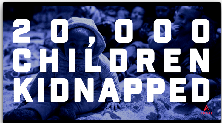
20,000 Ukrainian children have been kidnapped to Russia from their homes.