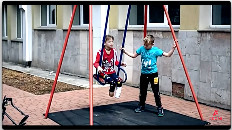
Injured children in Ukraine play on swings