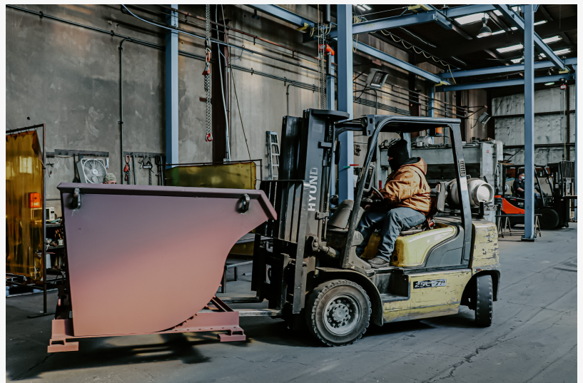
Star Industries Bucket Attachment