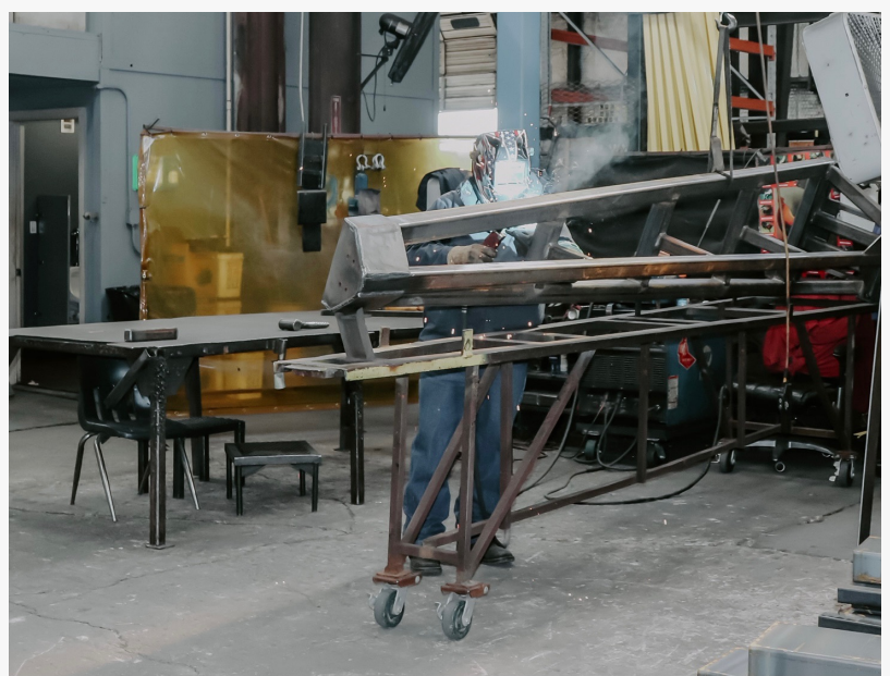
Star Industries Manufacturing Facility

Trey Thompson Star Industries +1 800-541-1797