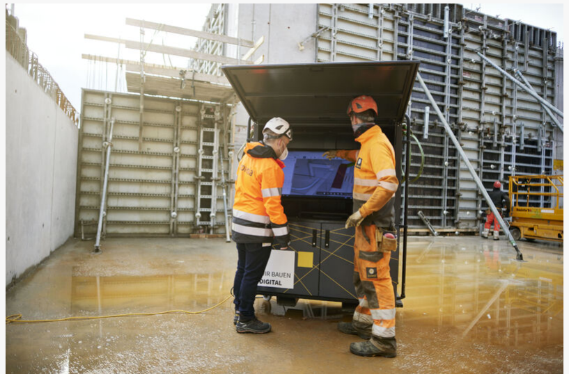
Braving the Elements with Ease