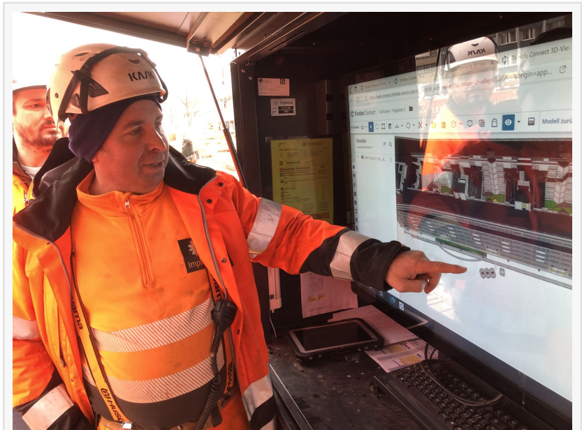
Itekube digital workstation streamlines BIM processes with rugged design