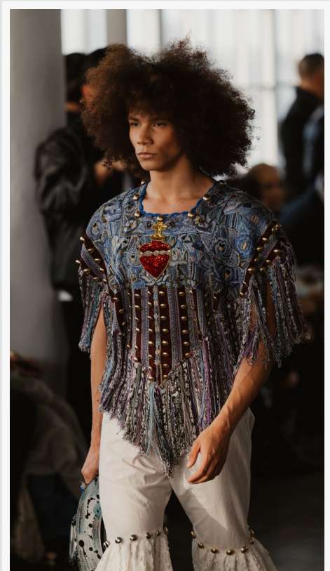
Model on the Runway for Aaron Fonseca

This press release can be viewed online at: https://www.einpresswire.com/article/785838836