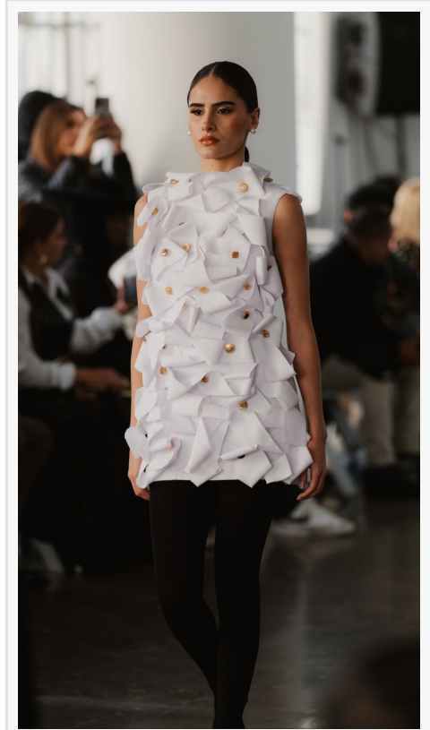
Model on the Runway for Barzaga

The FDLA NYFW experience concluded on February 11th at INNSIDE by Meliá New York NOMAD , where fashion enthusiasts had the exclusive opportunity to engage directly with designers at the Shop the Runway event. This final day allowed attendees to meet the creative minds behind the collections and purchase pieces straight from the runway, bridging the gap between high fashion and the consumer market.