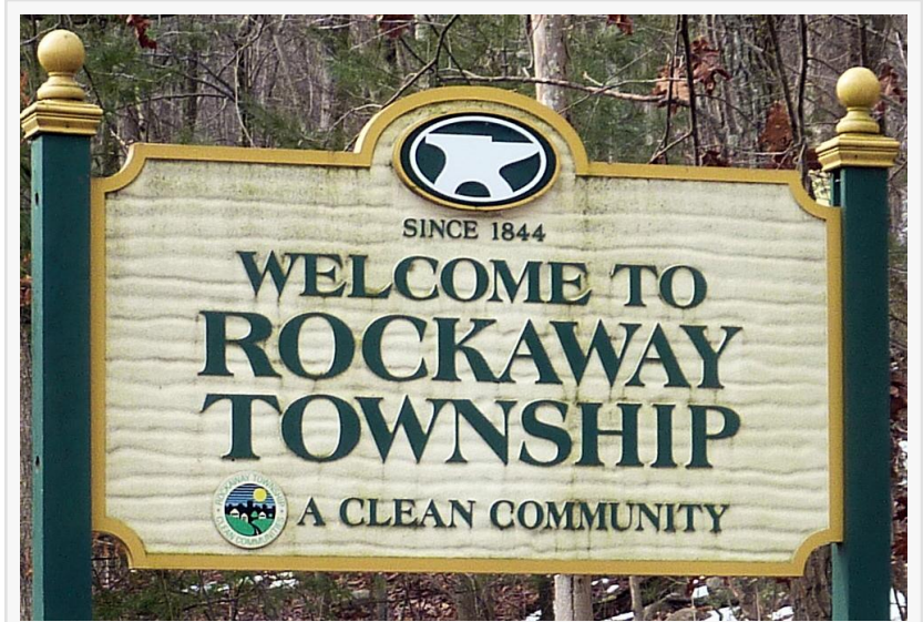
Columbus Day holiday preserved in Rockaway Schools.