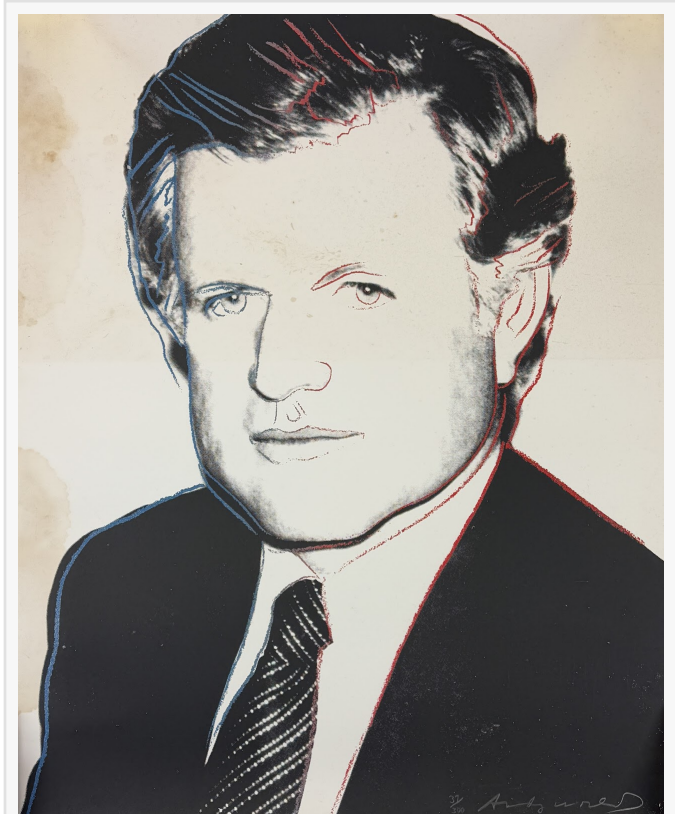
Andy Warhol (American, 1928-1987), portrait of Senator Ted Kennedy, serigraph, artist-signed and editioned 37/300, in graphite. Published in 1980 by Feldman & Schellmann for the Kennedy for President Committee. Estimate: $2,000-$3,000