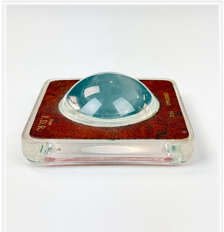
Franklin Delano Roosevelt Christmas gift to staff, a handsome desktop magnifying glass with gold-embossed leatherette covering. Inscribed 'Christmas 1943, From F.D.R.' Near-fine condition. Estimate: $500-$700

This press release can be viewed online at: https://www.einpresswire.com/article/785870154